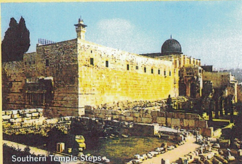
Southern Temple Steps

Scheduled International Flights • Top Quality Four Star Hotels • Israeli Buffet Breakfast & Dinner Daily • Top Guide with In-Depth Knowledge of the Old and New Testaments • Private Air Conditioned Motorcoach Visits to the Major Historical Sites • Boat Ride on the Sea of Galilee • Certificate of Your Pilgrimage to ISRAEL ..... .....and more!