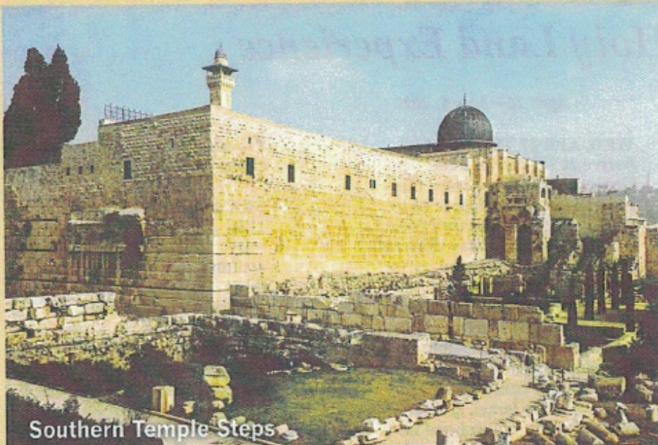
Southern Temple Steps

Scheduled International Flights • Top Quality Four Star Hotels • Israeli Buffet Breakfast & Dinner Daily • Top Guide with In-Depth Knowledge of the Old and New Testaments • Private Air Conditioned Motorcoach Visits to the Major Historical Sites • Boat Ride on the Sea of Galilee • Certificate of Your Pilgrimage to ISRAEL .....and more!